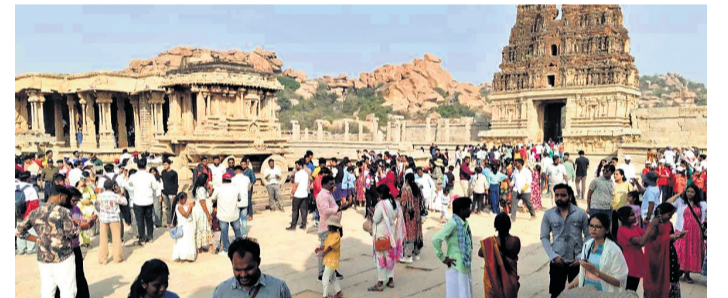
Hampi has the highest number of registered tourist guides in the state

Looking at the potential of coastal tourism, the government plans to implement a Comprehensive Coastal Tourism Development Plan. Connectivity to tourist destinations