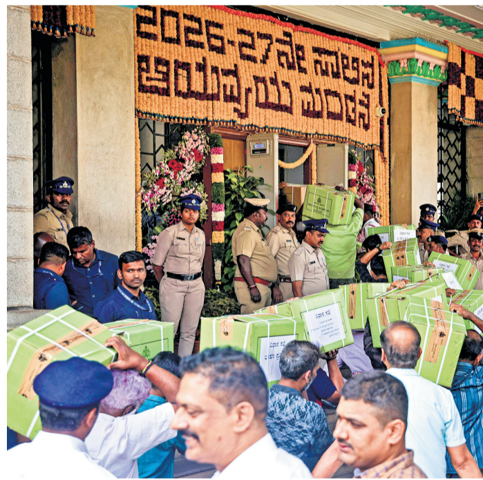
NUMBERS GAME Budget booklets being brought to Vidhana Soudha amid tight security before CM Siddaramaiah presented his record 17th budget on Friday

Under 'Operation Parishud-dikarana', sophisticated equipment, including artificial intrusion detection system, CCTVs, and body-worn cameras will be provided at a cost of Rs 20 crore to prevent the use of phones, marijuana and illegal activities in prisons. A drug de-addiction centre will be established on the premises of the Bengaluru Prison, he said.