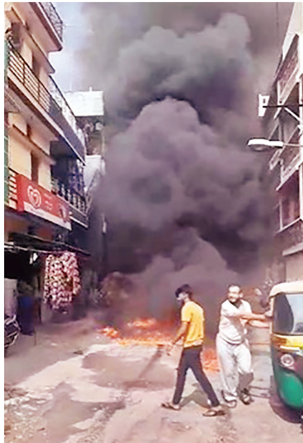
Several two-wheelers parked outside and near the factory were damaged

The police said fire engines were promptly dispatched to the scene, with firefighters to restrain the high flames. While they reported no casualties, some local residents have sustained minor injuries.