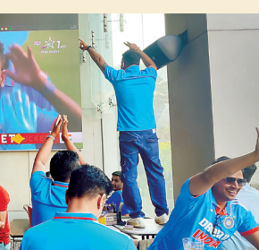
(Left) People watch the match at a mall on Mysore Road; OUT! Fans celebrate after a Pakistani wicket falls, at a private cafe in Bengaluru (right)

India in the match dismantled Pakistan for a