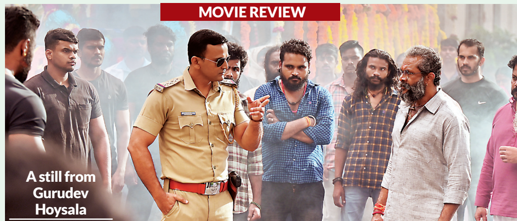
A still from Gurudev Hoysala