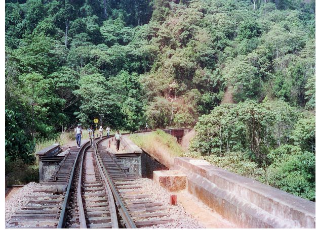
High on railway tracks near Sakleshpur

There are several rivers and fast flowing mountain brooks in the Western Ghats. One of the things we look forward to in a trek is a splash in one of them at noon-time. Near Yedekumari there was a fabulous setting in a secluded spot, with cool crystal clear water flowing through rocks. The sounds of splashing water and occasional bird calls makes it irresistible to leave.