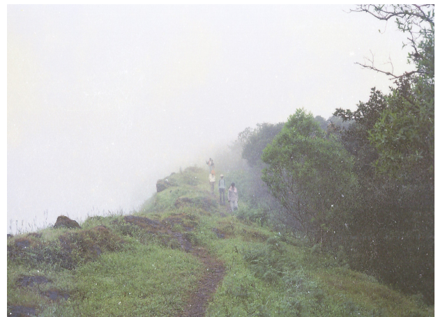
Trekking in rains near Kudajadri peak

Some experiences are esoteric. By the time we reached the peak of Kudajadri (in September 1990), it became dark and started raining. We had planned to climb down the same day and catch the night bus to Bangalore, but this was not possible. We looked around and found a hut, with two children– a 10-year old boy and his younger sister, who told us that their father had gone to the village below for provisions. Even in biting cold, the boy wrapped a wet cloth around his waist, and cooked a meal of rice and dal for us; the little girl helped in serving. Then they showed a broken hut nearby to take shelter for the night. Early in the morning, before leaving, we tried to give some money to the kids, but they refused. Years later, I came to know that the hill is associated with Adi Shankaracharya.