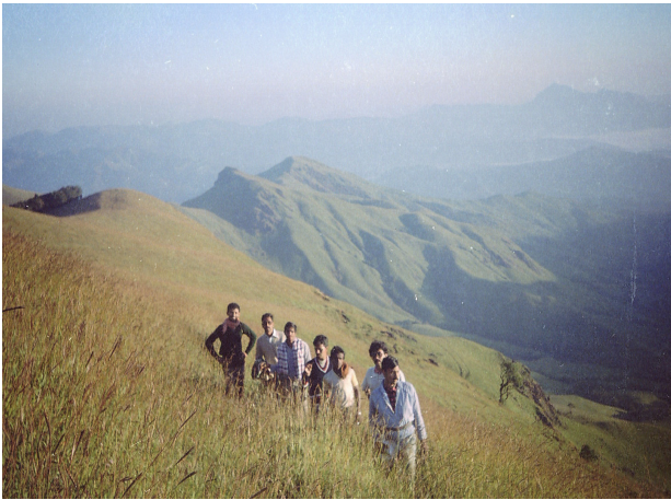
On way to Kudremukh in early morning

In this particular trek we carried provisions and even a pressure cooker. Collecting wood is easy, and cooking in a glade or an alcove of trees is great fun. And whatever the resulting concoction, it tastes like ambrosia.